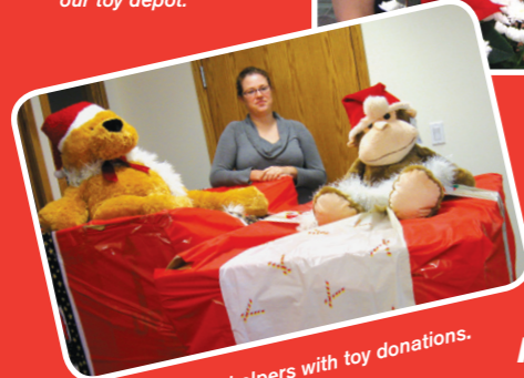
One of Santa's helpers with toy donations.

It helps put food in the children's tummy and presents under the tree.