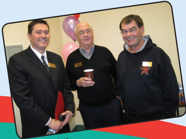
Board Members "Professional and dedicated staff with genuine concern for the welfare of others"

Thank you for your support for Deltassist's important work in our community.