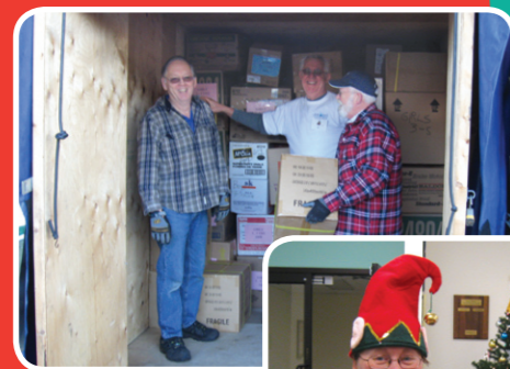
Santa's helpers: Two are members from the 38th Baden Powell Guild; all are volunteers who, year after year, deliver toys to our toy depot.