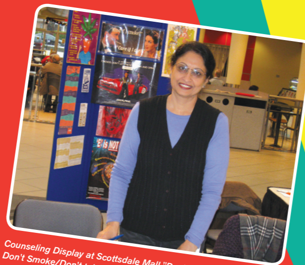
Counseling Display at Scottsdale Mall "Don't Drink and Drive/Don't Smoke/Don't take Drugs."

"I think you are doing a wonderful job at volunteering and assisting families in a time of need. I very much appreciate the help!"