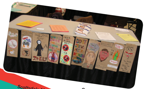
Scottsdale Mall "Don't Drink and Drive/Don't Smoke /Don't take Drugs" display. Counseling Display at