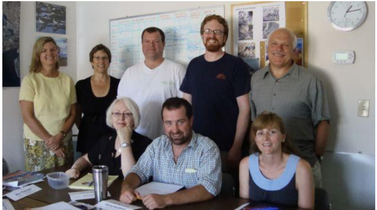
Delta Food Coalition Committee members