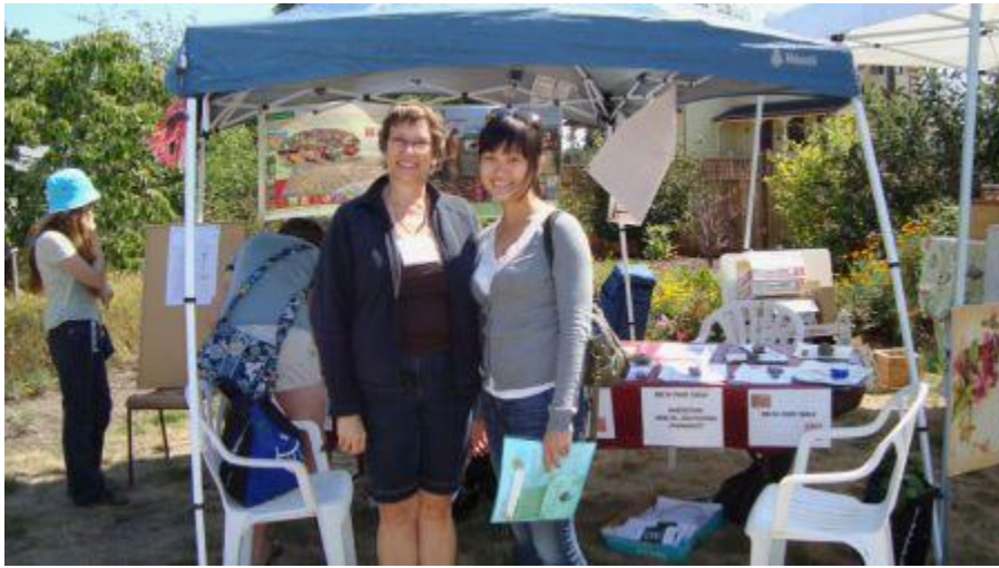
Earthwise Grow Local Fair