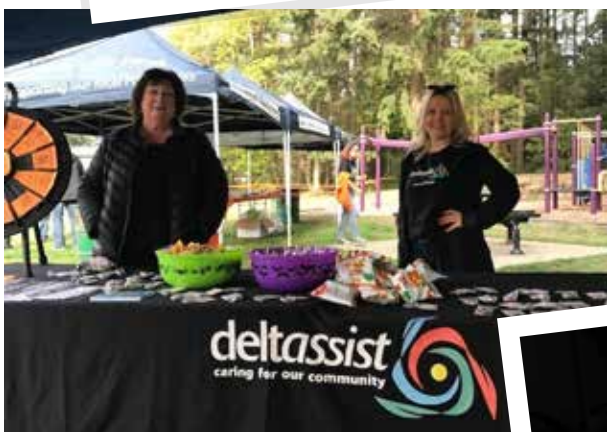
A-Team Pumpkin Party