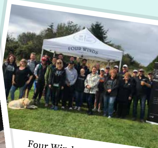
Four Winds Winded Event