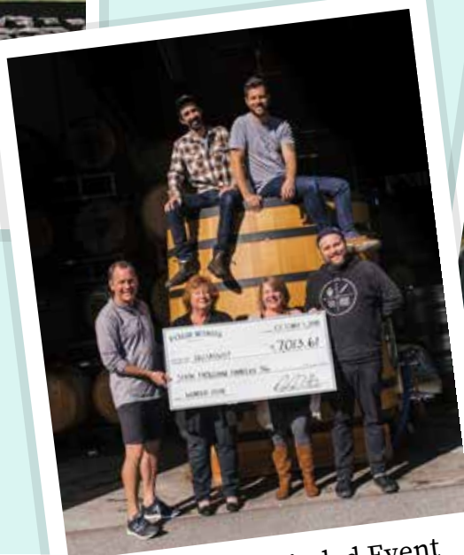
Four Winds Winded Event