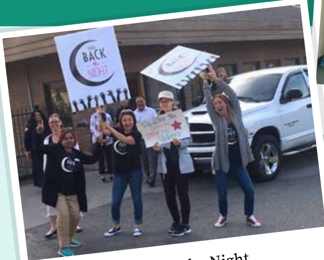
Take Back the Night