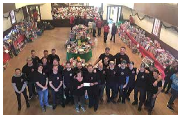
Christmas Toy Depot