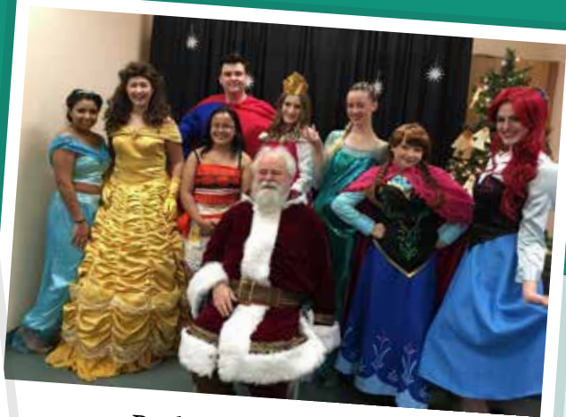
Prelude to Christmas