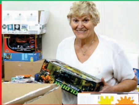
Toy Depot Volunteer