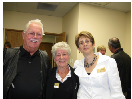
Volunteers and staff with the Senior's Shopping Program