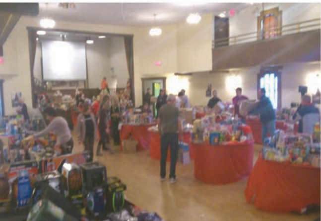
Christmas Toy Depot Volunteers