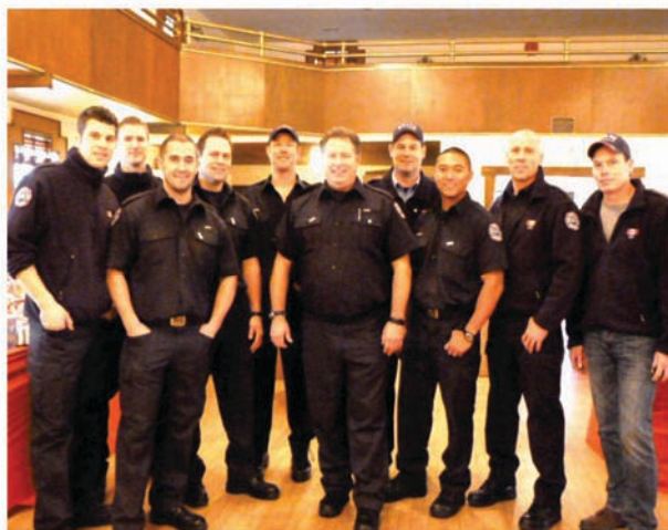
Delta Firefighters helping at the Toy Depot