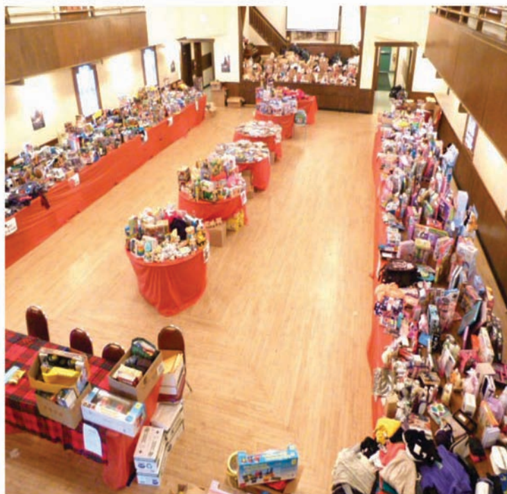
Toy Depot ready to open