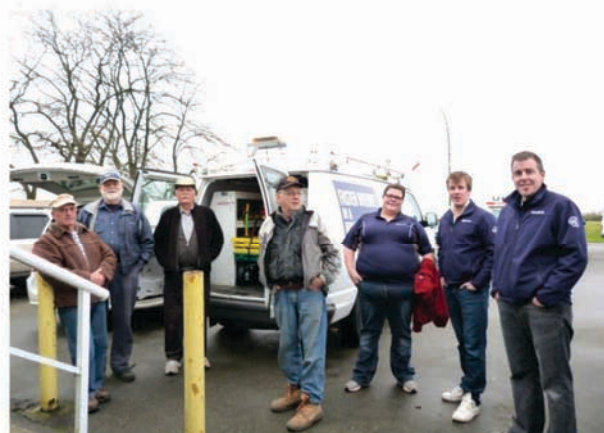
Toy Depot Set-Up Day 38th Baden Powell Guild and Delta Cable