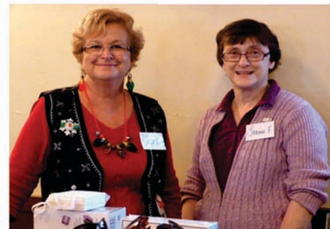
Toy Depot Volunteers

1361 - Alcohol and Drug Program 89 - Suicide Prevention Program 173 - Family Support Services 45 - Healthy Families Program 18 - Young Parents Outreach Program 69 - Victims of Violence 21- Survivors of Sexual Abuse 50 - Nobody's Perfect Parenting