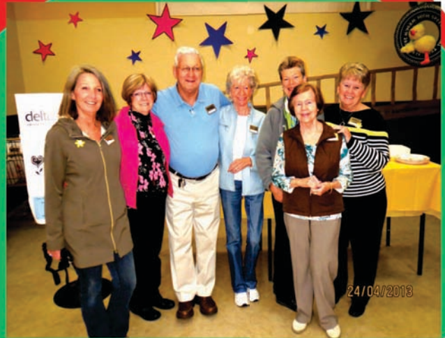
Senior's Shopping Volunteers

Check out our "Wish List" at www.deltassist.com