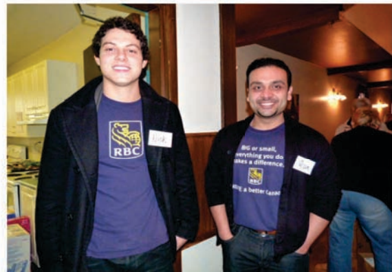
Royal Bank Volunteers

Team Costal Cycling TD Canada Trust TD Canada Trust—Ladner Centre Telus Corporation The Province - Empty Stocking Fund The Urban Rack Thrifty Foods T.O.O.B.S. TOPS BC #3439 TOPS BC #2162 TOPS BC #3585 TOPS BC #2848 Torch Bearer Alphas Trinity Lutheran Church Tsawwassen Boundary Bay Lions Club Tsawwassen First Nation Tsawwassen Legion Tsawwassen Medical Clinic Tsawwassen Pilates Studio Tsawwassen Rotary Tsawwassen Town Centre Mall Tsawwassen United Church The Parish of All Saints—Ladner Thursday Night Bridge Group Unipharm Wholesale Drugs Ltd. United Way of the Lower Mainland VanCity North Delta Community Branch VanCity Tsawwassen Community Branch Vancouver Foundation Vancouver Fraser Port Authority Wales McLelland Construction Watershed Artworks Society Westshore Terminals Limited Weyerhaeuser Women's Hospital Xcel Management Consulting Inc. Xi Beta Theta Sorority Xi Gamma Phi Zumba Fundraiser