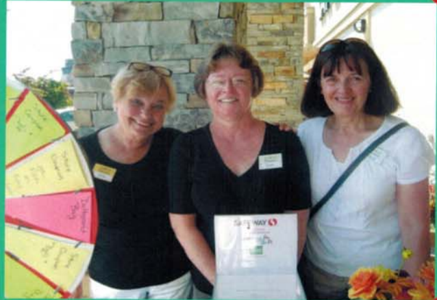
Senior's Shopping Volunteers

"Our volunteers are the magic that makes Deltassist such a special organization and Delta such a wonderful community to live in"