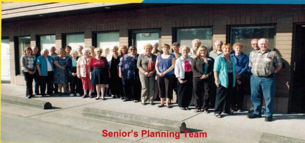
Senior's Planning Team