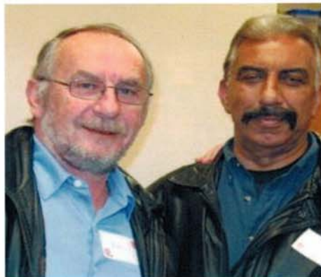
Christmas Hamper Volunteers