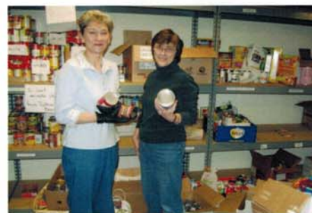
Volunteer Food Sorters

1715 - Alcohol and Drug Program 63 - Suicide Prevention Program 139 - Family Support Services 37- Healthy Families Program 20 - Young Parents Outreach Program 87 - Victims of Violence 21 - Survivors of Sexual Abuse