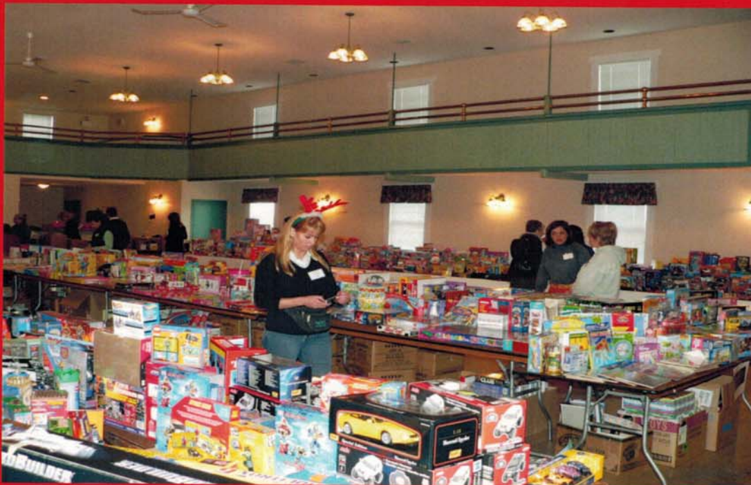
Christmas Toy Depot