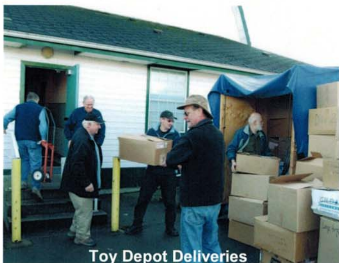
Toy Depot Deliveries

Ladner Baptist Church Ladner Christian Reformed Church Ladner Yacht Club Lions Gate Fisheries Ltd. Mary An Enterprises Maurice L. Bouchard Inc. Ministry of Children and Family Development Minister for Public Safety and Solicitor General NAI Holdings Ltd. Natural Comfort Aromatherapy New Horizons for Seniors Program Nordel Fellowship Baptist Church North Delta Secondary Pacific Newspaper Group P.A. Fishing Ltd. Peace Arch Good Sam Chapter Pebble Hill Traditional School Divisions 7 & 8 Pinewood Elementary School Port Guichon Elementary School Provincial Employees Community Services Fund R & G Paulin Bakery Inc. Rankin Skyline Services Ltd Raymond James Ltd. Real Estate Board of Greater Vancouver Robertson Optical Royal Canadian Legion Branch #61 Safeway Salon Manhattan Styles Shato Holdings Ltd St. Cuthbert Anglican Church St. Stephens United Church Sukh's Pharmacy Sunshine Ridge Baptist Church Sunshine Woods Ladies Golf Supernatural Films Inc. Telus Corporation T.O.O.B. TOPS BC #3439 TOPS BC #2162 TOPS BC #3585 TOPS BC #2848 United Way of the Lower Mainland Vancouver City Savings Vancouver Foundation Vancouver Fraser Port Authority Westshore Terminals Limited