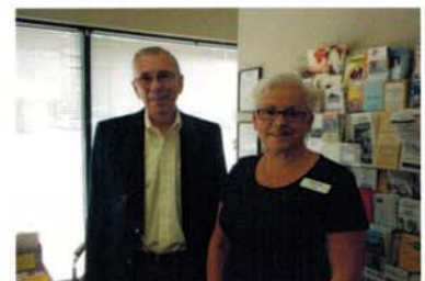
Receiving Donation in Ladner Office