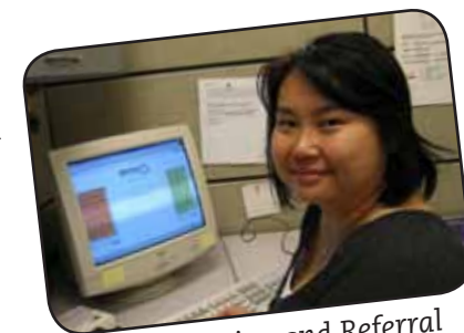
Information and Referral Volunteer (I&R)