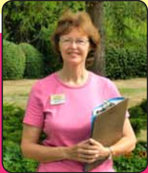
Volunteer Intake Worker