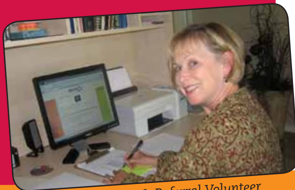
Information & Referral Volunteer