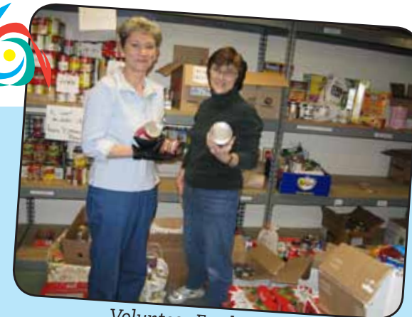
Volunteer Food Sorters